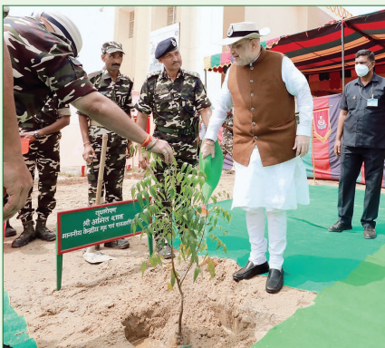
Union Home Minister & Minister of Cooperation Shri Amit Shah plants a sapling at Kishanganj in Bihar.