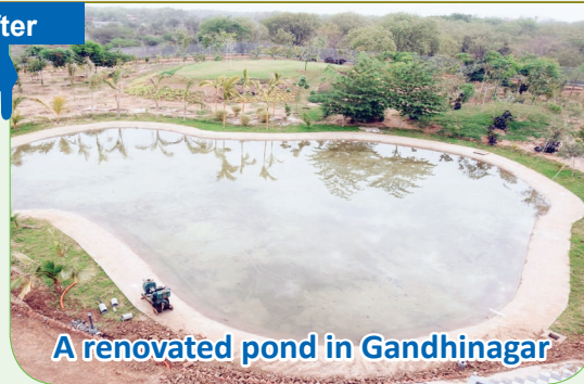
A renovated pond in Gandhinagar