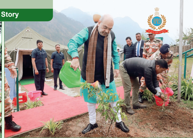
Union Home Minister & Minister of Cooperation Shri Amit Shah at a plantation event at Kibithu in Arunachal Pradesh.