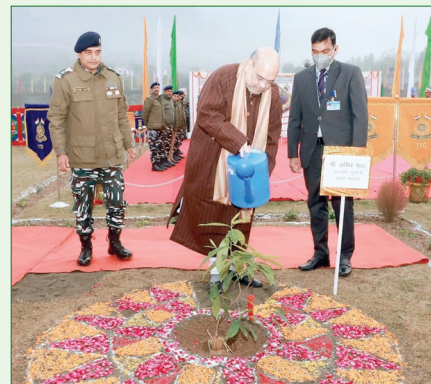
Union Home Minister & Minister of Cooperation Shri Amit Shah plants a sapling at Lethipora, J&K.