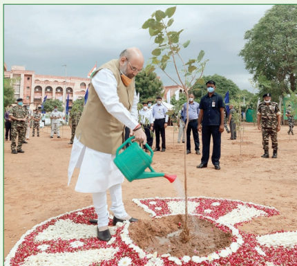
Union Home Minister & Minister of Cooperation Shri Amit Shah plants a sapling at Guwahati in Assam.