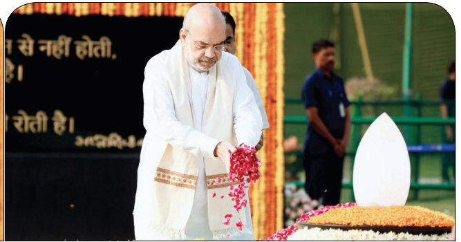
Prime Minister Shri Narendra Modi and Union Home Minister and Minister of Cooperation Shri Amit Shah pay floral tributes to former Prime Minister Shri Atal Bihari Vajpayee at the Sadaiv Atal on the leader's fifth death anniversary.