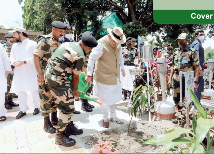
Union Home Minister & Minister of Cooperation Shri Amit Shah takes part in a tree plantation drive at Tin Bigha in West Bengal.